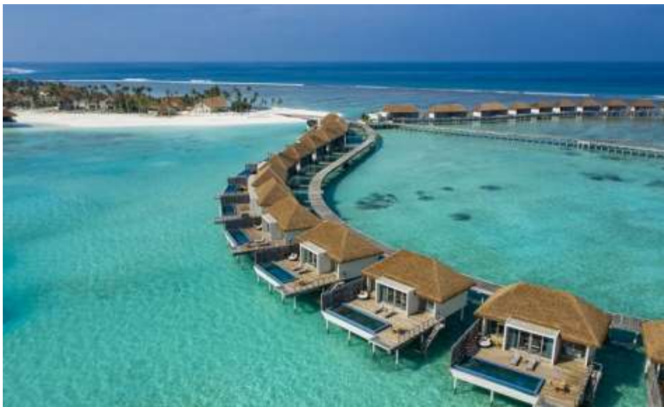
Image: Aerial view of Radisson Blu Resort Maldives

Radisson Blu, the upper-upscale brand that delivers personalized service in stylish spaces, has opened Radisson Blu Resort Maldives – a private island retreat in the Alifu Dhaalu Atoll which becomes Radisson Hotel Group's first property in the Maldives.